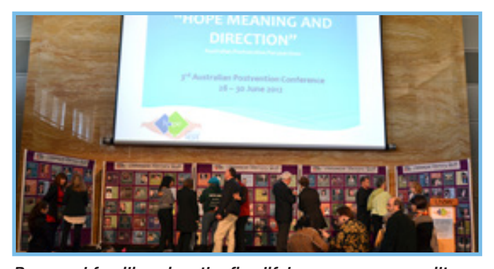
Bereaved families view the five lifekeeper memory quilts.