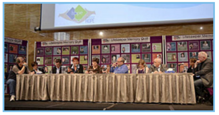
Expert panel shares insights in an open discussion on the future direction for postvention.